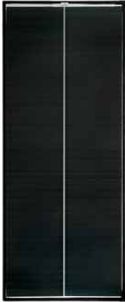
2.4 (+2/-0) J-Box extension beyond glass edge